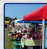
Arts & Craft Show