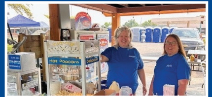
Grayling Kids Day