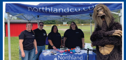
Reed City Crossroads Festival