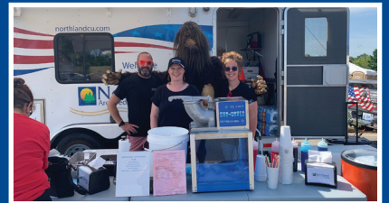
Oscoda Canoe Finish Line